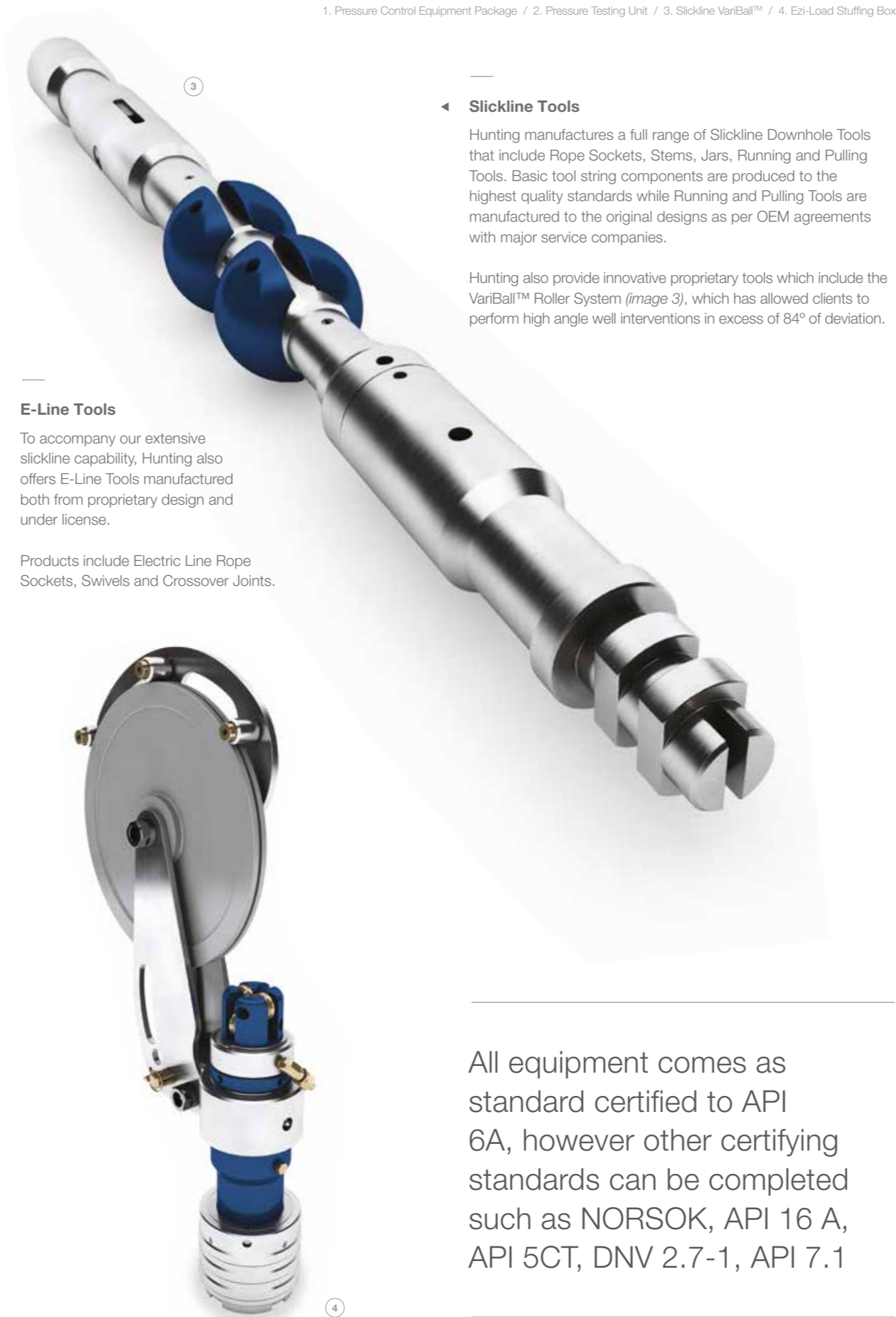
1. Pressure Control Equipment Package / 2. Pressure Testing Unit / 3. Slickline VariBall™ / 4. Ezi-Load Stuffing Box