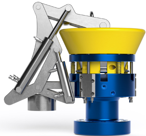
1 Arm in locked position

The unique profile of the lock ring and the use of springs ensure the lock ring will always stay in position in the event of hydraulic failure.